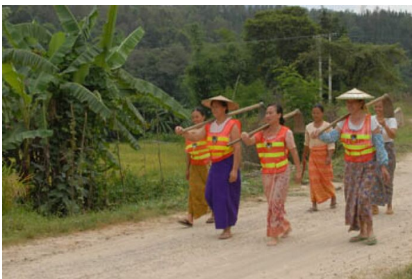
Dai women from Mangpai village maintain the road that has helped their community earn more on its crops.