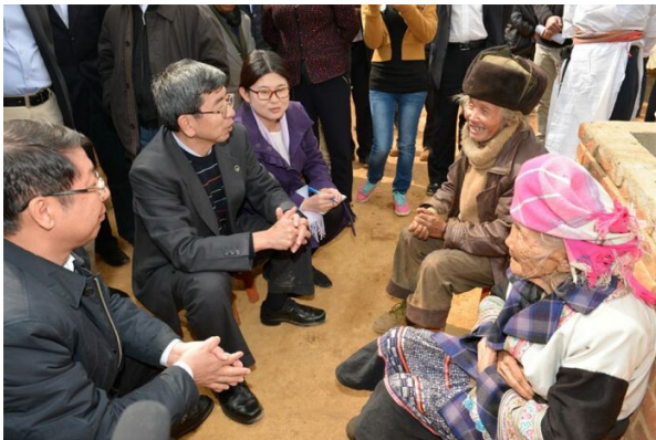
ADB President Nakao talking to the old residents of Yunnan Province that they will be benefited of the project.