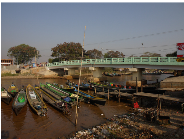
Concrete bridge links two sides of Nyaung Shwe. Thanks to its status as a major tourist attraction, Nyaung Shwe enjoys good road and highway infrastructure.