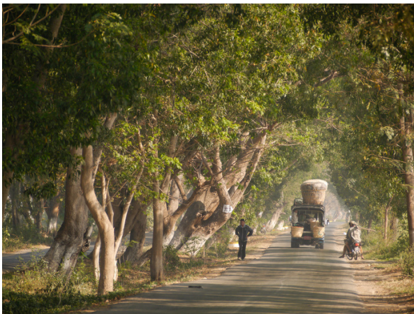
Picturesque tree-lined roads lead from Nyaung Shwe to neighboring communities around Inle Lake. This area is one of Myanmar's most popular tourist attractions.