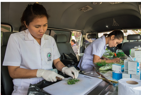
Technicians from the government performing their tasks in response to the enhanced sanitary and phytosanitary management systems.