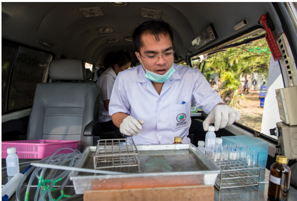
Technicians from the government performing their tasks in response to the enhanced sanitary and phytosanitary management systems.