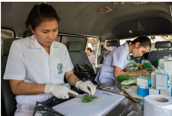
Technicians from the government performing their tasks in response to the enhanced sanitary and phytosanitary management systems.