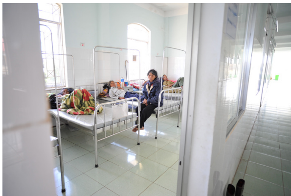
The dengue prevention campaign focuses on spraying for the mosquitoes and emptying sources of standing water that act as the mosquito's breeding ground.