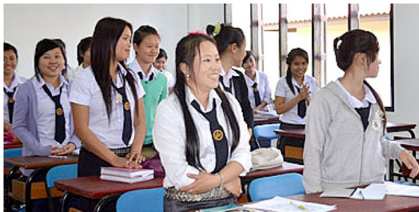
Scholarships for female students help them prepare for a career in the water and sanitation sector.