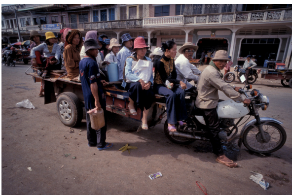
Motorcycle pulls a trailer full of passengers in a thoroughfare in Cambodia.