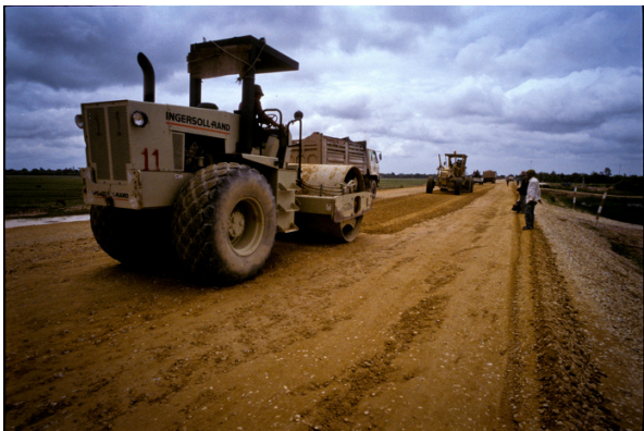
Heavy vehicle operator drives a road roller during the leveling and upgrading of a road in Cambodia.