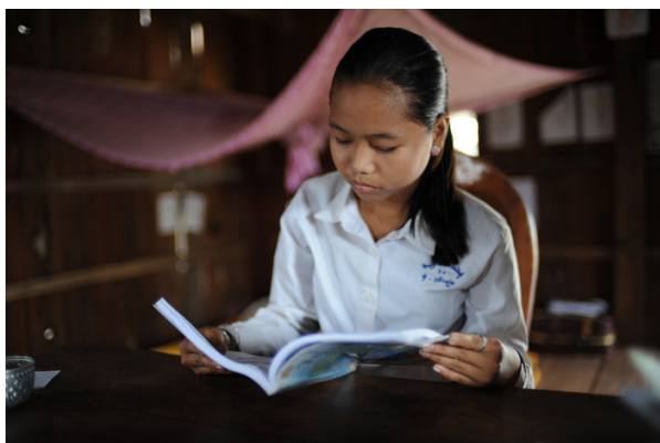
She says she hopes to become a doctor someday.

Source: http://www.adb.org/news/photo-essays/moving-better-lives-cambodia