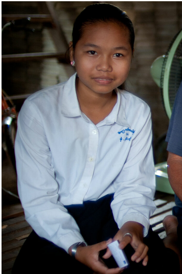
A happy 12-year-old girl relocated because of the railway project.