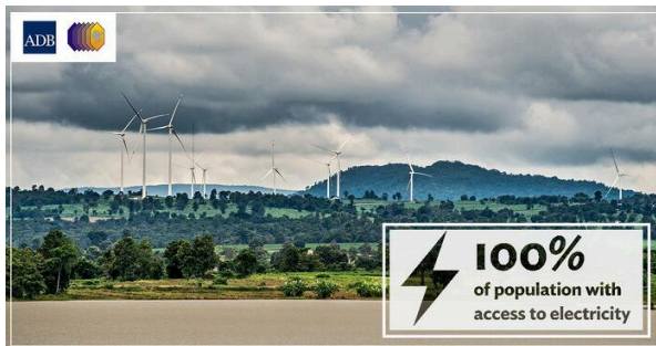
Building a Sustainable Energy Future: The Greater Mekong Subregion