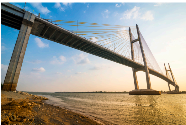
Tsubasa Bridge in Prey Veng Province provides a safer, climate-resilient, and cost-effective provincial road network with all-year access to markets and other social services.