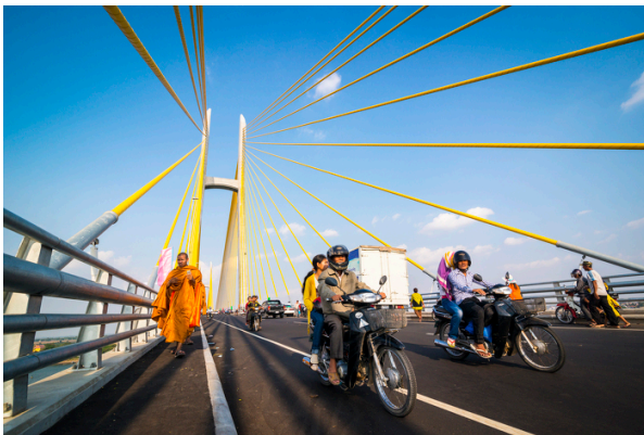
Tsubasa Bridge in Prey Veng Province provides a safer, climate-resilient, and cost-effective provincial road network with all-year access to markets and other social services.