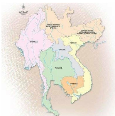
The Greater Mekong Subregion Economic Cooperation Program supports the implementation of high-priority projects in the six nations that share the Mekong River.