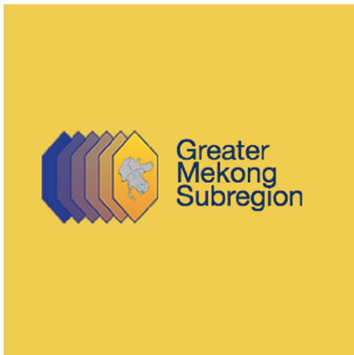
Greater Mekong Subregion Program logo.