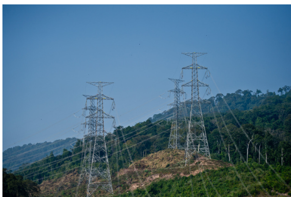
The taller power lines delivers 500kV of electricity to Thailand, while the smaller mast delivers 115kV of electricity for domestic use.