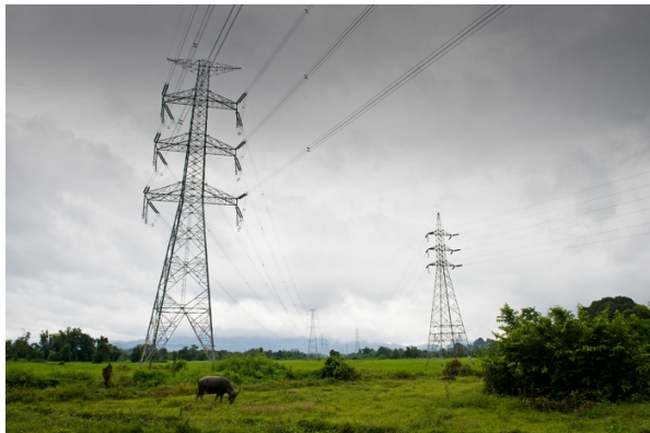
Power transmission lines from the Nam Theun 2 Hydropower facility.