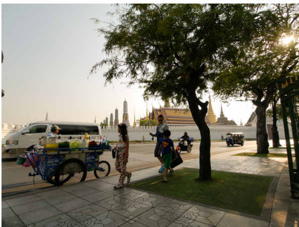
Locals enjoy the greenery and open space afforded by the Sanam Luang, a public square just opposite Bangkok's Grand Palace. The Thai Fine Arts Department has listed Sanam Luang as a historical site in 1977.