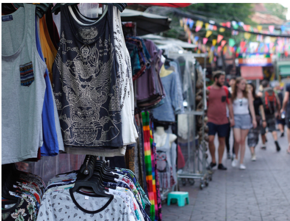
Tourists shop for items at the sprawling street market in Bangkok's Banglamphu district. Centered around Khao San Road, this neighborhood attracts the largest number of foreign tourists in the capital.