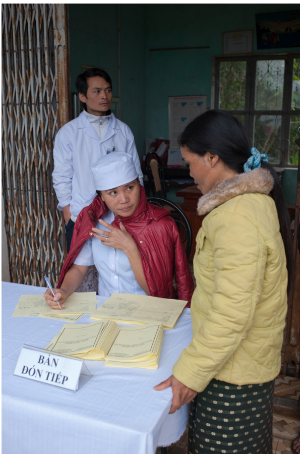
Woman is being interviewed for her medical history at the Mobile Sexually Transmitted Infections Clinic in Dakrong District, Quang Tri Province, Viet Nam.