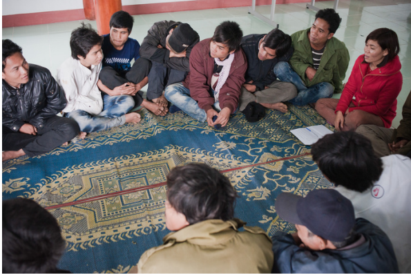
Young people learning about health and sexual behavior during a group discussion at Vung Kho Village, Dakrong Commune, Dakrong District, Quang Tri Province, Viet Nam.