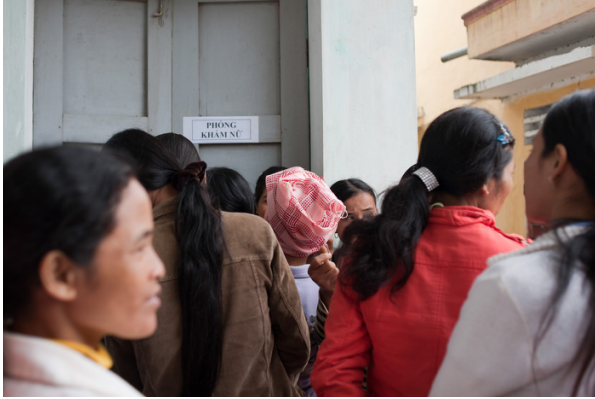
Patients waiting for consultation at the Mobile Sexually Transmitted Infections Clinic in Dakrong District, Quang Tri Province, Viet Nam.