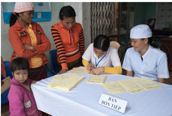
Patients waiting for consultation at the Mobile Sexually Transmitted Infections Clinic in Dakrong District, Quang Tri Province, Viet Nam.