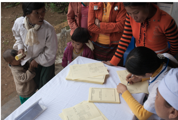
Patients waiting for consultation at the Mobile Sexually Transmitted Infections Clinic in Dakrong District, Quang Tri Province, Viet Nam.