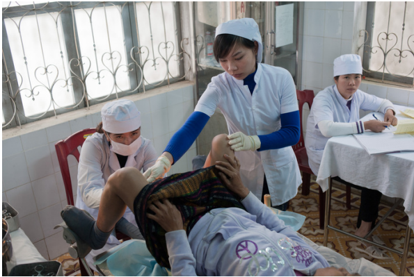
Patient undergo a check up at the Mobile Sexually Transmitted Infections Clinic in Dakrong District, Quang Tri Province, Viet Nam.