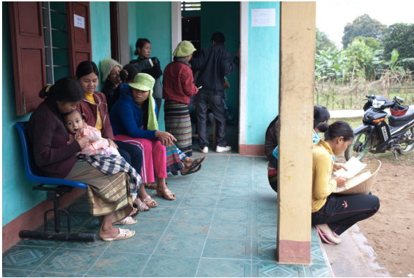
Patients waiting for consultation at the Mobile Sexually Transmitted Infections Clinic in Dakrong District, Quang Tri Province, Viet Nam.