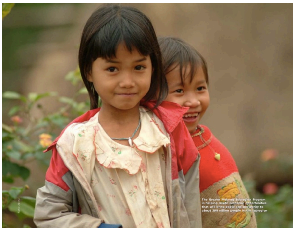
The Greater Mekong Subregion Economic Cooperation Program supports the implementation of high-priority projects in the six nations that share the Mekong River.