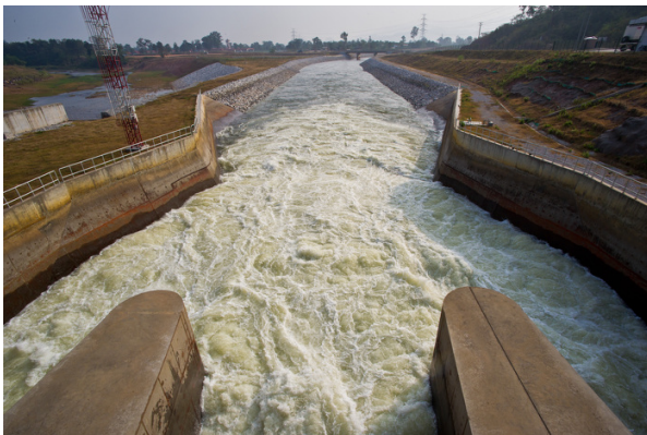
A reservoir of the Nam Theun 2 Dam.