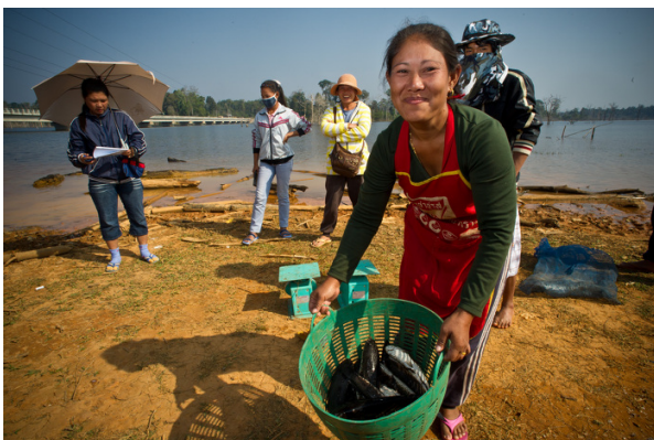
The relocated villagers from the Nam Theun 2 Hydroelectric Project have had livelihood training. New jobs are bringing in greater profits.