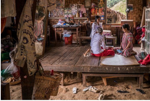
Midwives making a house call to a pregnant woman to check her health and also do malaria testing.