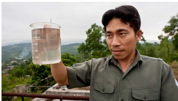
During the water supply plant testing, an ADB-financed project, to provide clean water to ethnic minorities.