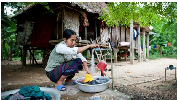
One of the ethnic minorities that have now clean water for home use.