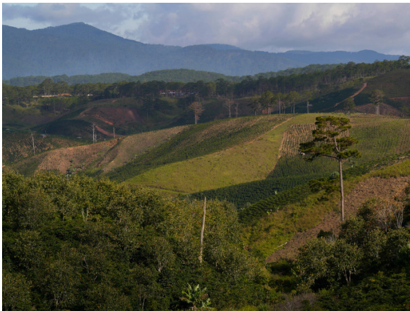
The countryside of Da Nhim displays a mix of virgin forests and cultivated land.