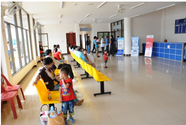
The improved "gateways" to tourist areas including the extensions of runways and airport facilities at Louang Namtha, Lao PDR.