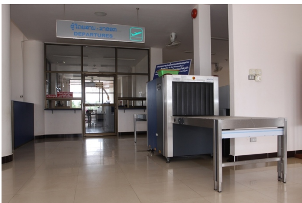
The improved "gateways" to tourist areas including the extensions of runways and airport facilities at Louang Namtha, Lao PDR.