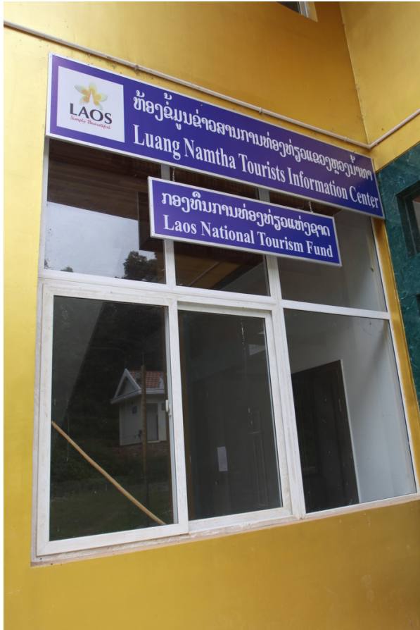
Tourism-related infrastructure improvement at Luang Namtha Province, Lao PDR.