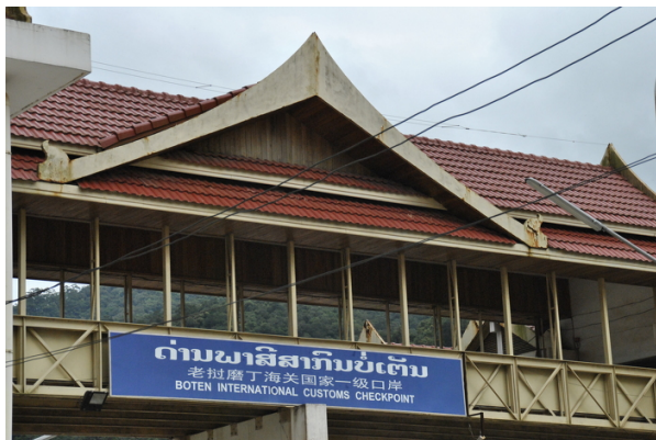
Tourism-related infrastructure improvement at Luang Namtha Province, Lao PDR.