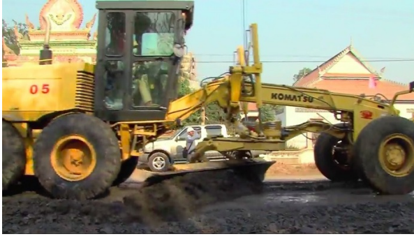
During the civil works of Southern Coastal Corridor in Cambodia.