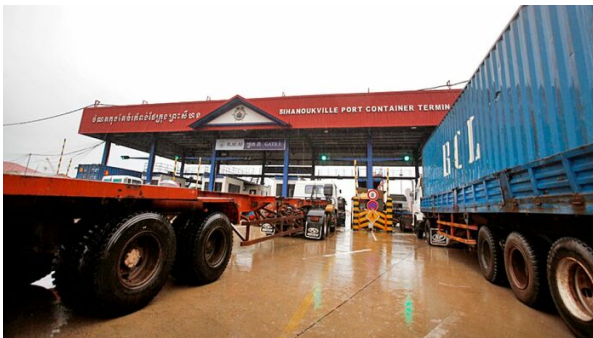
Good roads along the Southern Coastal Corridor are helping increase the flow of goods into and out of the Sihanoukville Autonomous Port.