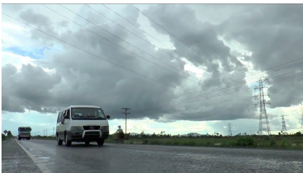
An improved national road in Southern Cambodia.