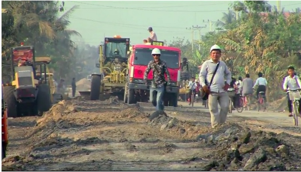
During the civil works of Southern Coastal Corridor in Cambodia.