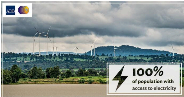
Building a Sustainable Energy Future: The Greater Mekong Subregion