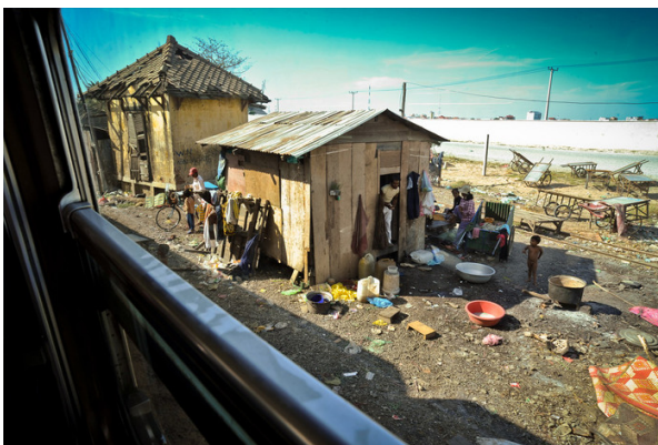
People living very close to the railway need to relocate as they are in constant danger from passing trains.