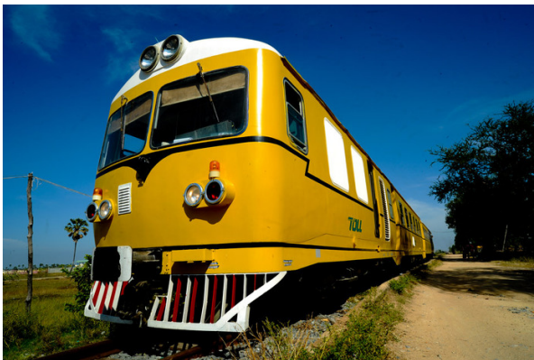
Cambodia has revived an old rail network to spur the country's economic development and bring the region a step closer to having a pan-Asian railway.