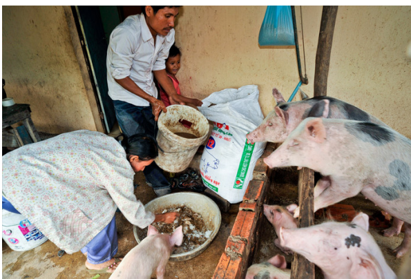
The residence at Sihanoukville relocation site are allowed to use vacant land to farm pigs and chickens to augment the family income.