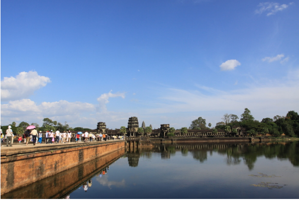
Tourist visitors at Angkor Wat.