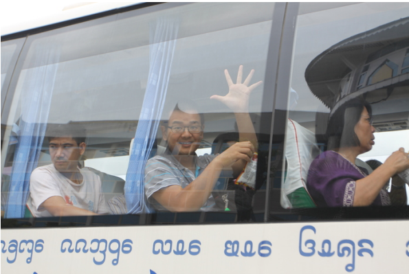
Tourist visitors at Angkor Wat.