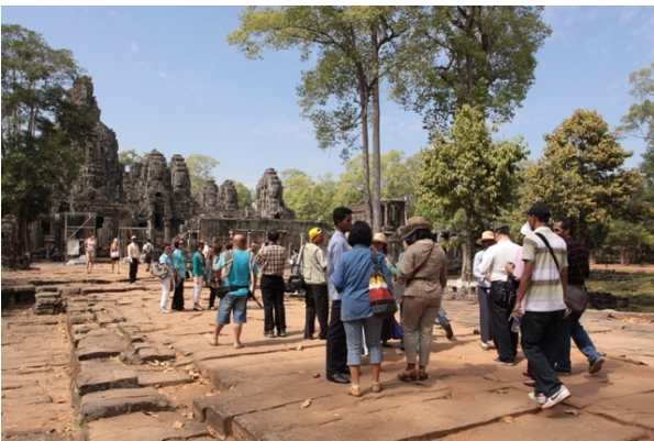
The tourism-related local microenterprises and communities.