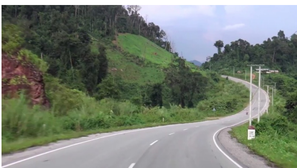
Physical completion of the highway to the all-weather status.