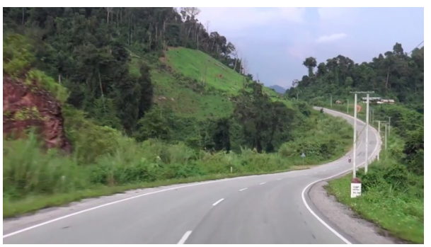
Physical completion of the highway to the allweather status.