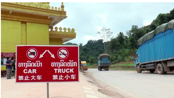
Border check point on the Lao PDR side.