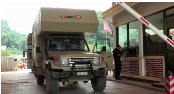
Border check point on the Lao PDR side.