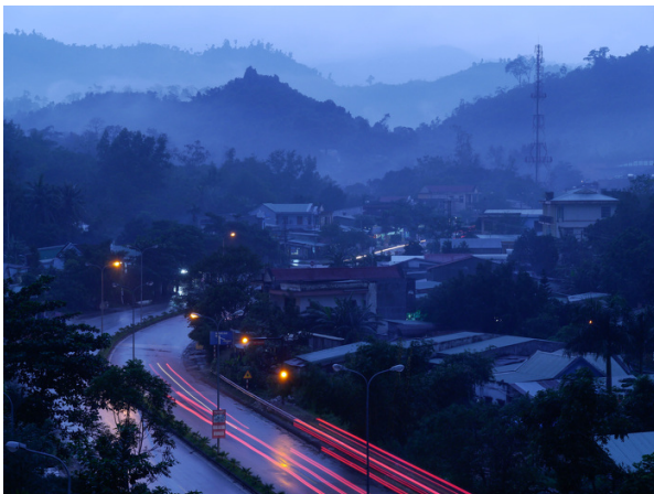
The town of Thanh My is one of many that lie amidst the forests of A Vuong, an important watershed that provides hydropower needed to generate electricity for Vietnam.