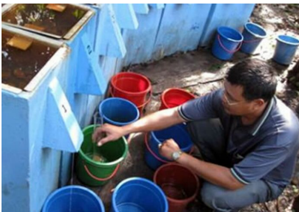
People enjoying the benefits of the water treatment facility.