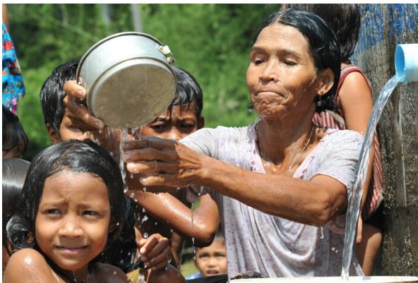
People enjoying the benefits of the water treatment facility.