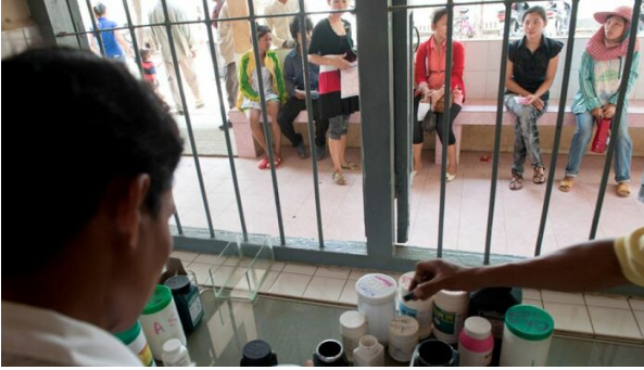
Pharmacy at a health clinic.