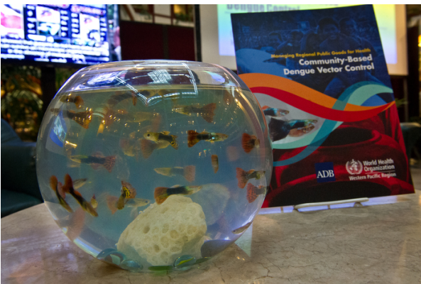
Guppy fish in open-air water containers can help destroy the breeding grounds of mosquitoes and stop the spread of dengue fever.