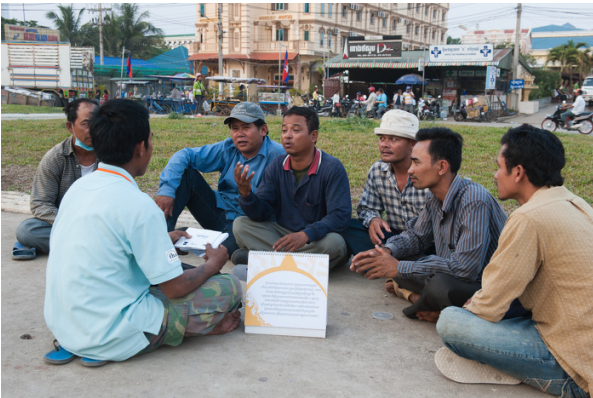
The HIV/AIDS peer education group.