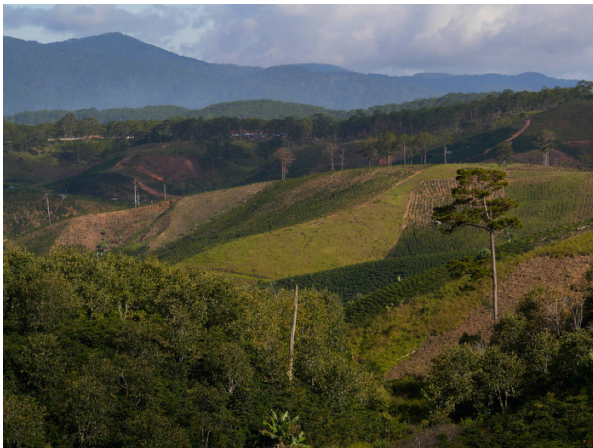
The sustainably managed biodiversity corridors in Cambodia, the Lao PDR, and Viet Nam.