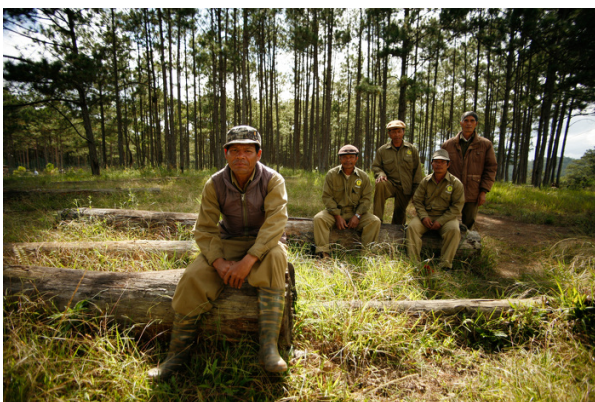
KâꞰho villagers from the Da Chais commune prepare to go out on patrol in Da Nhim.