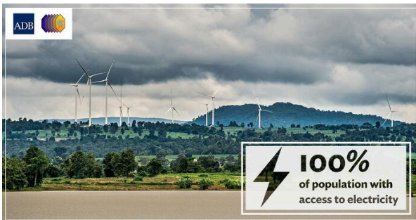
Building a Sustainable Energy Future: The Greater Mekong Subregion