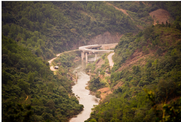
The "Road 9" or East-West Corridor is a transport corridor running from the border of Viet Nam-Lao PDR to Dong Ha, Viet Nam.