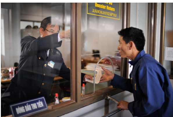
The Lao Bao international checkpoint in Viet Nam.