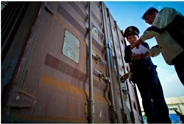
A Viet Nam customs official checking papers of container trucks in Lao Bao international checkpoint.