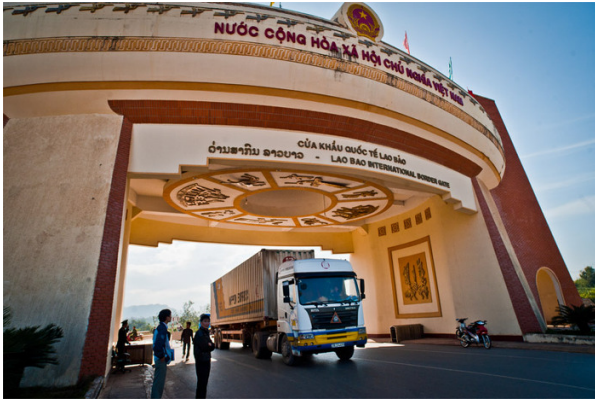
The Lao Bao international checkpoint in Viet Nam.