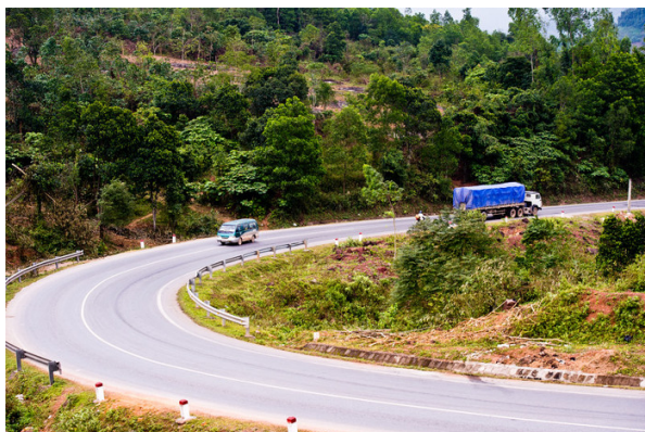
A portion of the East-West Corridor in Bao, Quang Tri province in Viet Nam.