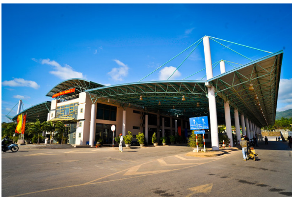
The ADB's assistance to the rehabilitation and improvement of Road 9 is contributing to the quick development of the area - establishing new businesses along Road 9.