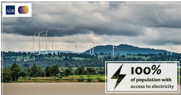
Building a Sustainable Energy Future: The Greater Mekong Subregion