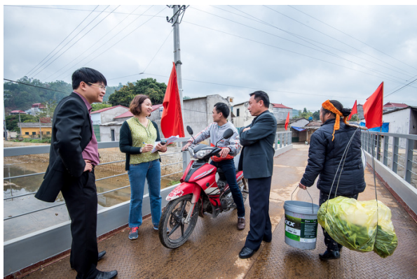
Comprehensive Socioeconomic Urban Development Project in Viet Nam (Lang Son Province)