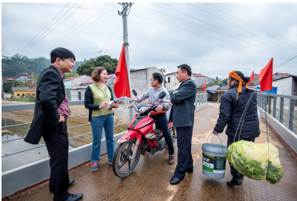
Comprehensive Socioeconomic Urban Development Project in Viet Nam (Lang Son Province)