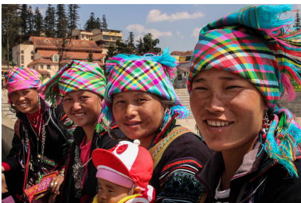
Women from the Hamong tribe in Sapa, Northern Viet Nam. The tribe has seen a boost in tourism since the completion of the Hanoi-Lao Cai Expressway.