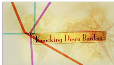
Knocking Down Borders in the GMS