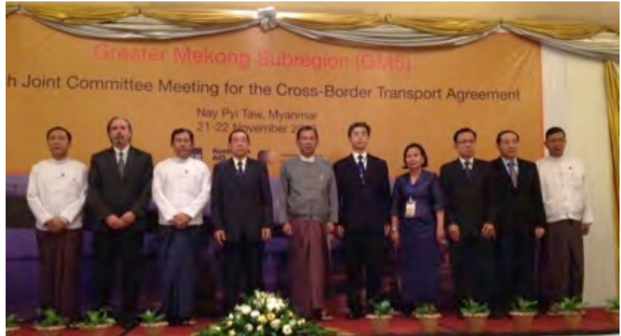
Heads of Delegation of the 4 th Joint Committee Meeting for the GMS CBTA from Cambodia, PRC, Lao PDR, Myanmar, Thailand and Viet Nam

The GMS Transport and Trade Facilitation Knowledge Portal ( www.gms-cbta.org ) is expected to serve as: (i) an information exchange hub for transport and trade facilitation; (ii) a tool for increased collaboration between GMS countries in order to increase awareness on TTF issues and disseminate best practices; and (iii) a public interface and repository for data and statistics on border monitoring indicators, corridor performance indicators, traffic, and trade.