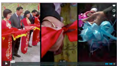
Transport Facilitation in the GMS

The videos highlighting GMS transport facilitation best practices and recent achievements under the GMS Cross-Border Transport Facilitation Agreement (CBTA) was produced under RETA 7851: Support for Implementing the Action Plan for Transport and Trade Facilitation in the GMS and disseminated to stakeholders in order to increase awareness and understanding (especially at the provincial and border level) of transport facilitation issues and challenges.