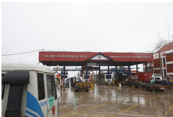
The improved Sihanoukville Port Container Terminal.