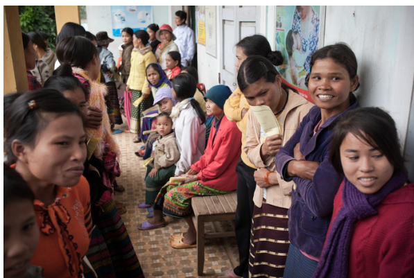
Women patiently wait for their turn for medical consultation at a health center in Dakrong District, Quang Tri Province.