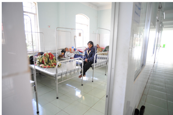
Ward of Ngoc Hoi District Hospital in Kon Tum Province, Viet Nam.