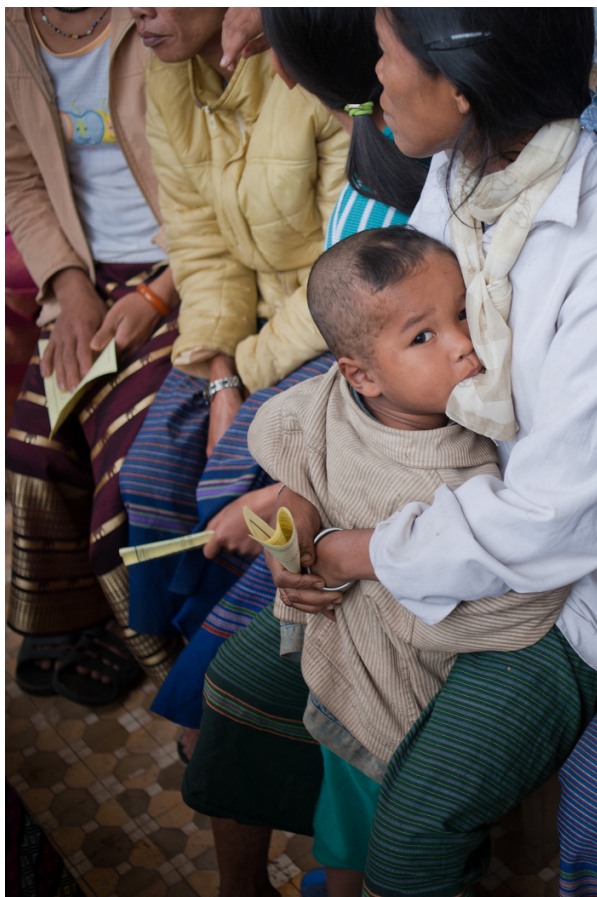
A mother brings her child for medical consultation at a health center in Dakrong District, Quang Tri Province.