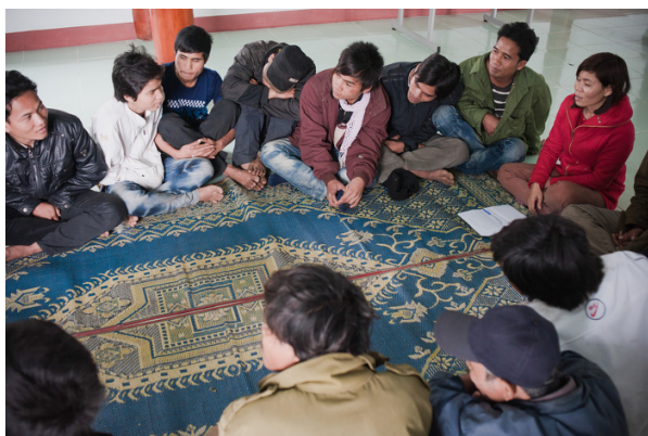
Young people listen and discuss during a DVD session to learn about health and sexual behavior, at Vung Kho Village, Dakrong Commune, Dakrong District, Quang Tri Province.