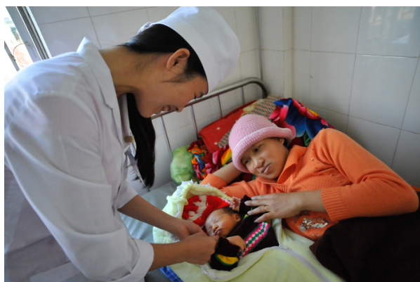
A mother and child after caesarean birth at Ngoc Hoi Hospital in Kon Tum Province with financial assistance received from ADB.