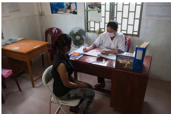
An entertainment worker visits a local health clinic where she can get free weekly check ups.