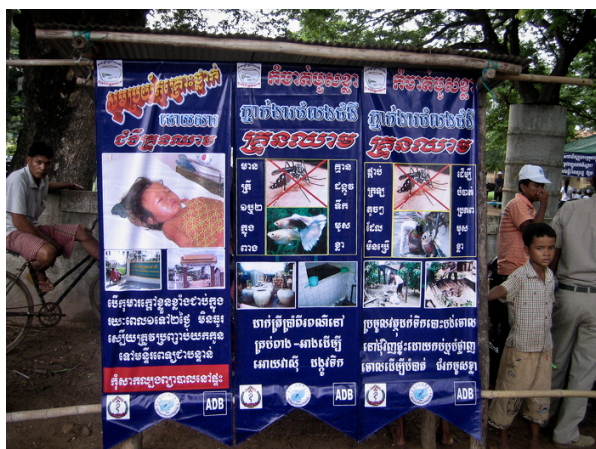
Campaign for Dengue Prevention.