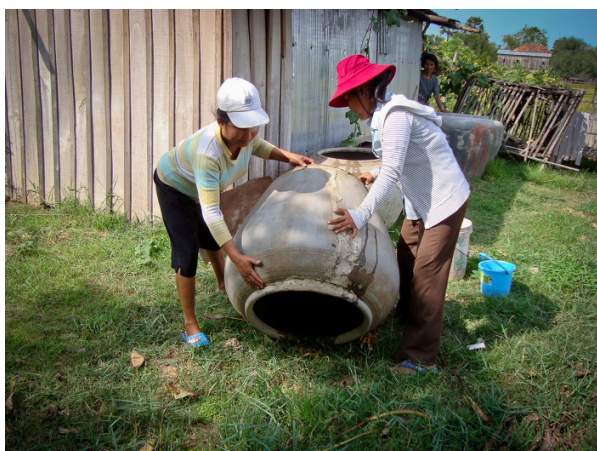
The dengue prevention campaign focuses on spraying for the mosquitoes and emptying sources of standing water that act as the mosquito's breeding ground.