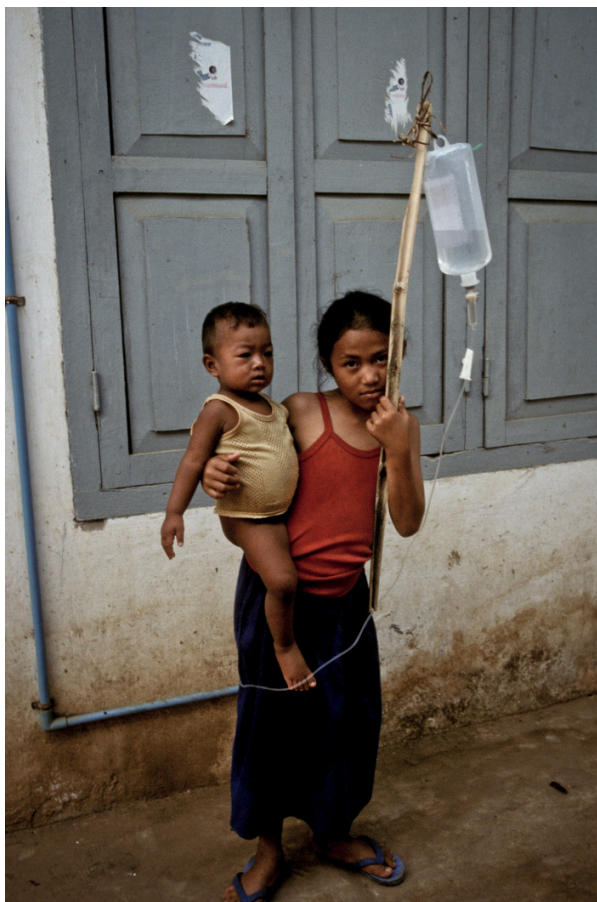
A girl holds her sick brother.