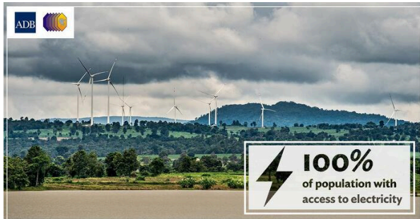
Building a Sustainable Energy Future: The Greater Mekong Subregion