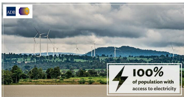
Building a Sustainable Energy Future: The Greater Mekong Subregion