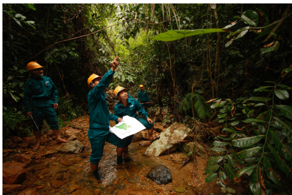
Patrollers task in maintaining the general well-being of the forest.